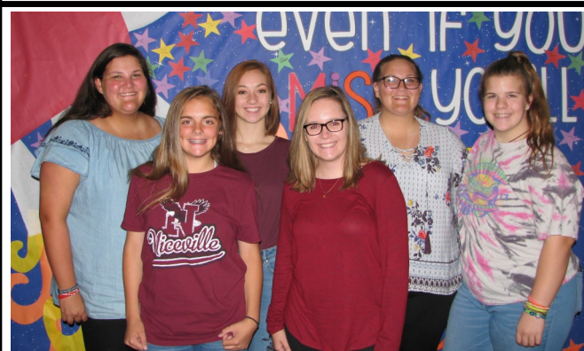
Former YES Students coming back to Job Shadow.

Would you, or someone you know, like to sponsor a child or a family for Christmas?